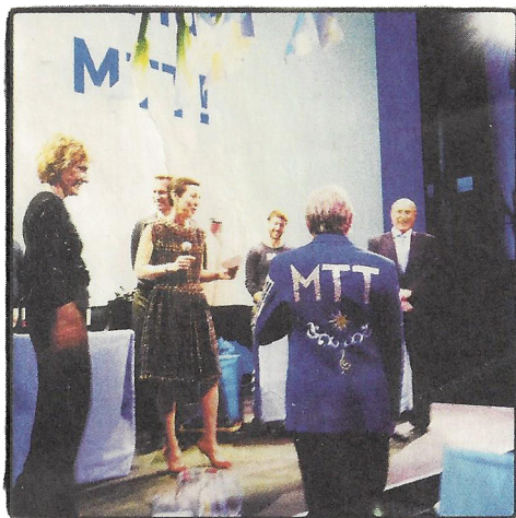
7:21 p.m. Jan. 15: Michael Tilson Thomas sports his personalized 70th birthday tux jacket.